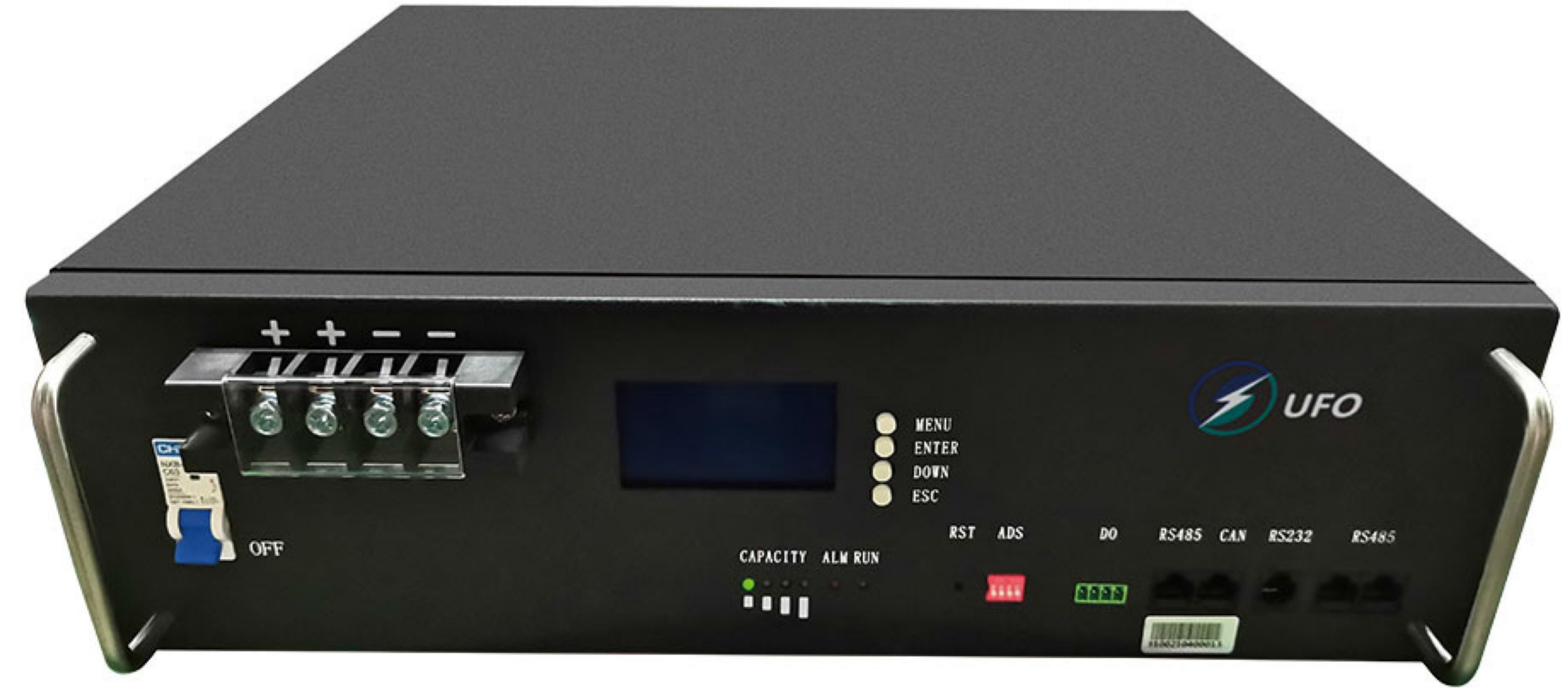
UFO LiFePO4 BATTERY SPECIFICATIONS